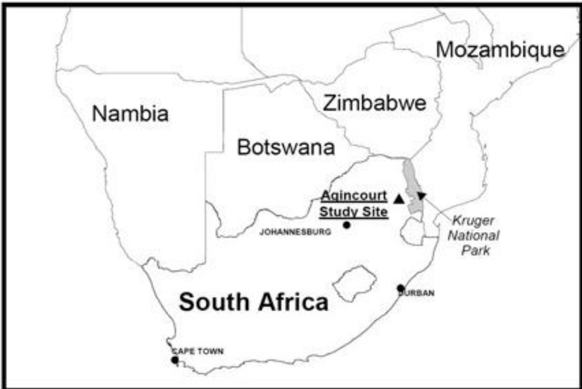
Fig 1a: Location of Agincourt field site