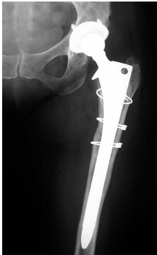
Fig. E1-D At sixty-eight months, the osteotomy had healed and the femoral component was osseointegrated.