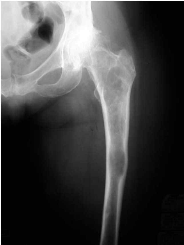
Fig. E1-A Preoperative radiograph of a sixty-five-year-old woman (Case 1) with monostotic fibrous dysplasia of the proximal part of the femur and a resultant varus deformity.