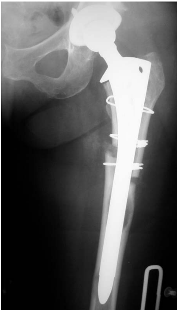
Fig. E1-C Postoperative radiograph. A second osteotomy of the medial cortex was required for full deformity correction.