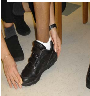
Plantarflexion, active assistive