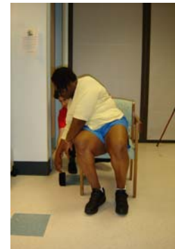
Ipsilateral posterior (paretic)