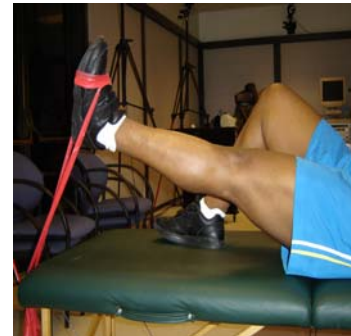
Hip flexion with Theraband