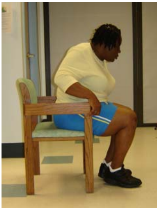
Sit to stand, back in chair, push with arms