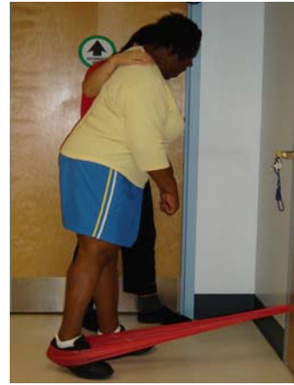
Hip extension, with Theraband