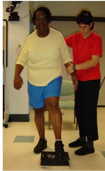
Staggered stance, nonparetic leg on step