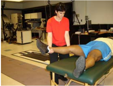
Hip Abduction, gravity eliminated