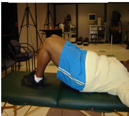
Hip Extension, bilateral bridge