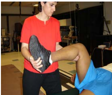
Hip Flexion, knee to chest, active assistive