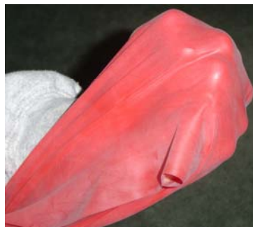
Finger extension, w/Theraband - begin