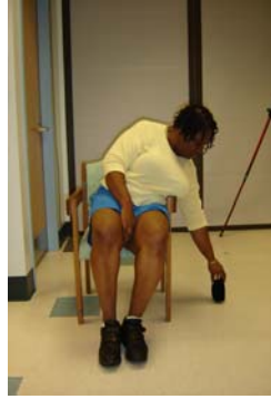
Ipsilateral posterior (nonparetic)