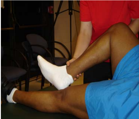
Knee flexion, supine heel slide, active assistive