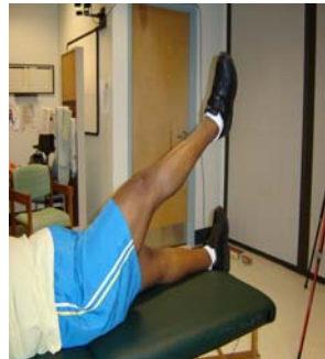
Hip flexion, active