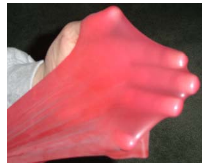
Finger extension w/Theraband - end