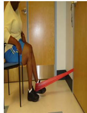
Knee flexion with Theraband