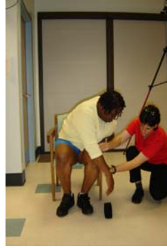
Contralateral anterior (paretic)