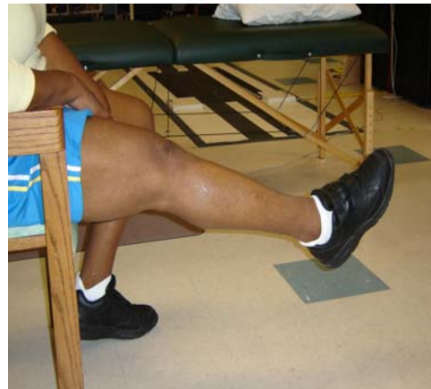
Knee extension, sitting, against gravity