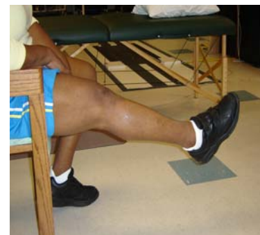
Knee extension, sitting, active