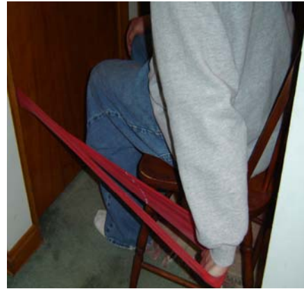
Elbow extension, with Theraband