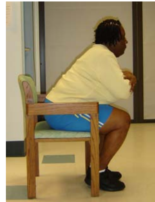
Sit to stand, back in chair, arms folded