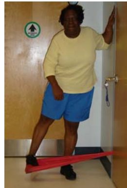
Hip abduction with Theraband