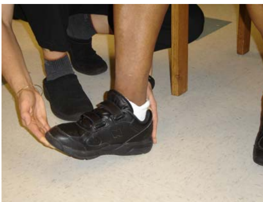
Ankle dorsiflexion, active assistive