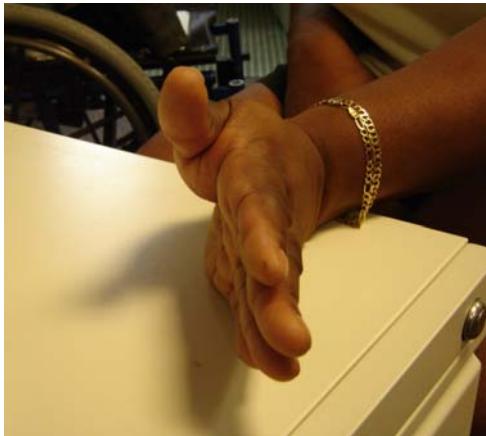
Wrist extension, gravity eliminated