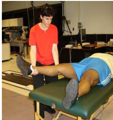
Hip abduction, active assistive

For ankle plantarflexors, at each session, begin at one level below highest level participant achieved at previous visit. Complete that level five times, then progress to level at which participant is not able to maintain 3 seconds. Record highest level participant was able to maintain for 3 seconds. Repeat exercise at this level up to 10 times.