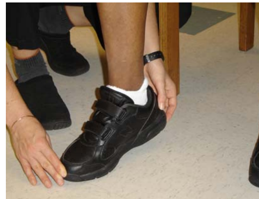
Ankle plantarflexion, active assistive

Remember to monitor vital signs after every 5 minutes of activity.