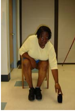
Ipsilateral anterior (nonparetic)