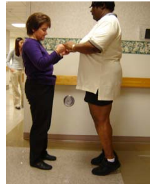
Plantarflexion, standing, both legs

For hip extension, hip abduction knee flexion and knee extension, TheraBand can be stabilized in a closed door. For hip flexion, TheraBand can be stabilized underneath the leg of bed or couch or can be stabilized by the therapist. For ankle dorsiflexion, the therapist can stabilize TheraBand.