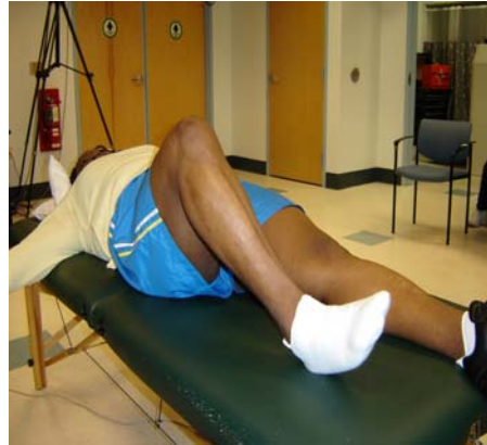
Knee flexion, supine heel slide, active