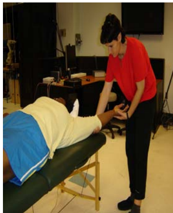
Shoulder abduction, gravity eliminated