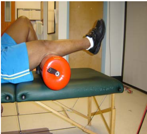
Knee extension, supine over bolster, against gravity