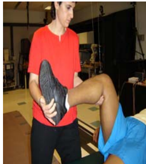
Hip flexion, active assistive