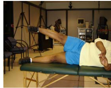
Hip Abduction, against gravity