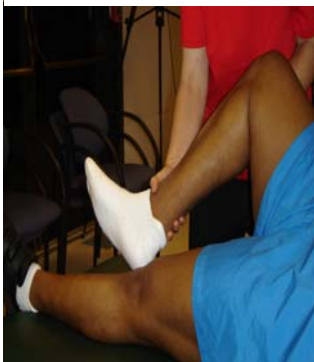
Knee flexion, active assistive