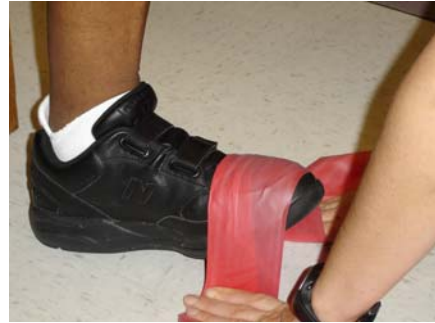
Dorsiflexion with TheraBand