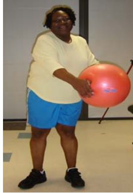
Catching ball towards nonparetic side