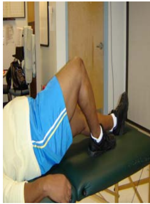
Hip extension, single leg bridge