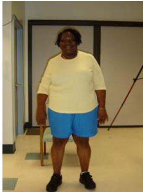
Standing, shoulder width stance