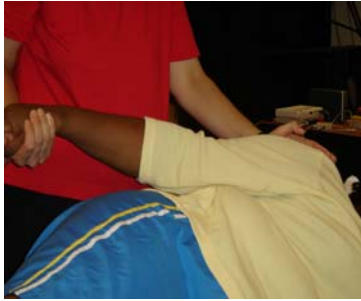
Shoulder extension, gravity eliminated