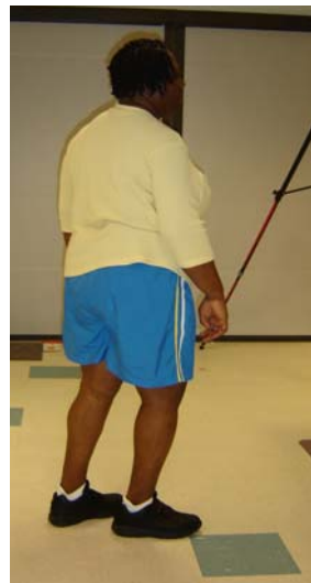
Turning towards nonparetic