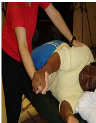
Shoulder flexion, gravity eliminated

If the participant cannot grasp the TheraBand secondary to hand weakness, the therapist can assist the participant in doing so. For shoulder flexion, elbow flexion and wrist extension, the TheraBand is stabilized by the participant's foot, for shoulder external rotation, shoulder extension and elbow extension, the TheraBand is stabilized by a closed door.