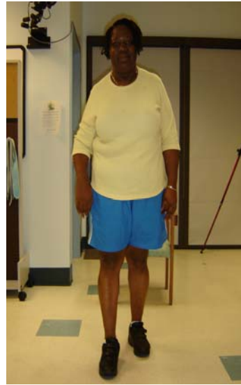
Staggered stance, paretic in front