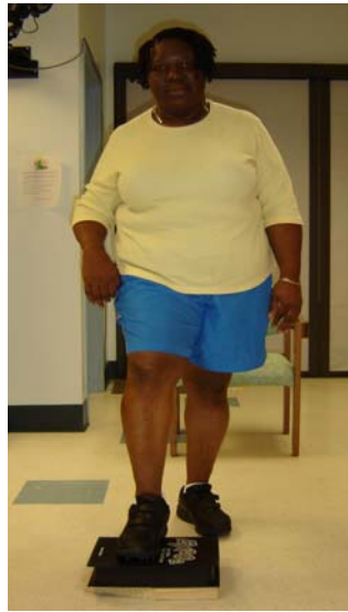
Staggered stance, paretic leg on step