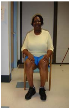
Sitting with equal weight