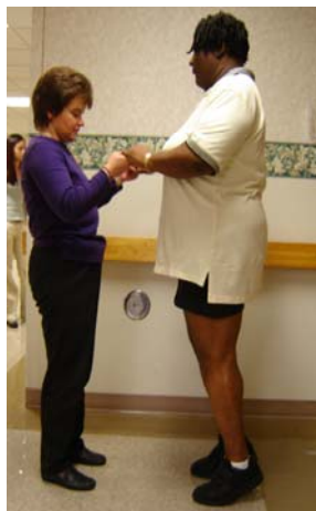
Standing, holding, up on both feet

At each session, begin at one level below highest level participant achieved at previous visit. Complete that level five times, then progress to level at which participant is not able to maintain 3 seconds. Record highest level participant was able to maintain for 3 seconds. Repeat exercise at this level up to 10 times.