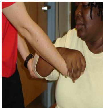
Elbow flexion, gravity eliminated