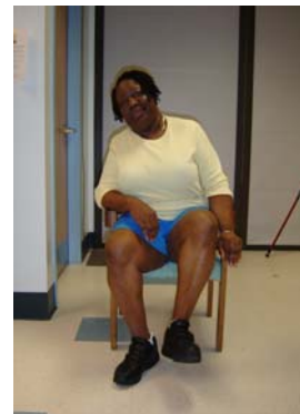
Weight shift to paretic side