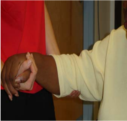
Elbow extension, gravity eliminated