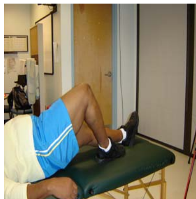
Hip Extension, unilateral bridge