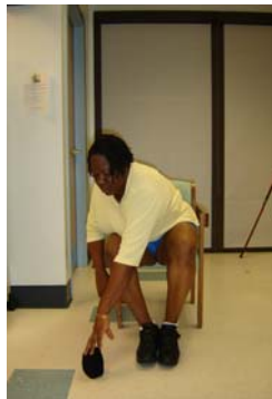
Contralateral anterior (nonparetic)