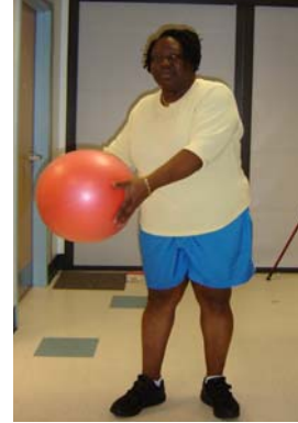
Catching ball towards paretic side