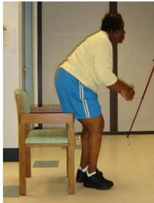
Sit to stand, edge of chair, arms out