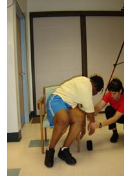
Contralateral posterior (paretic)