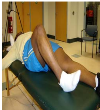
Knee flexion, active