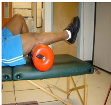
Knee extension, over bolster