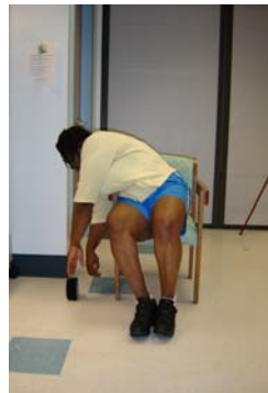
Contralateral posterior (nonparetic)