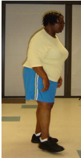
Turning towards paretic